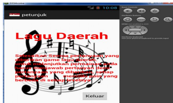
Figure 3. Display instructions form

The hint form contains the game directives and rules in the game Song area.