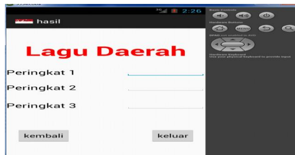
Figure 5. Display Game form

This form is the result of a regional song game that contains points from all players