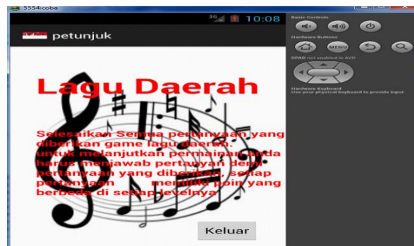
Figure 3. Display instructions form

The hint form contains the game directives and rules in the game Song area.