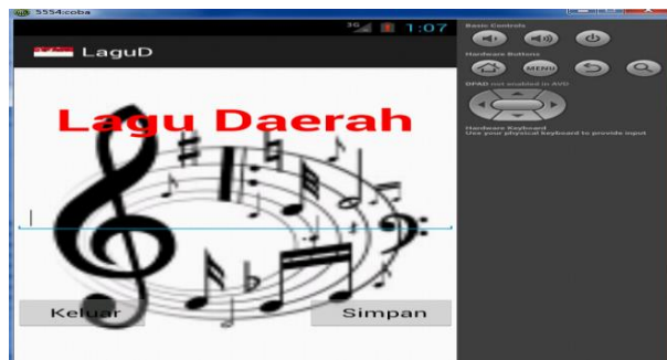
Figure 2. Display name input form

This name input form aims to enter the name for starting the game.