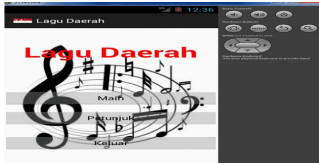
Figure 1. Display the main menu form

The main menu form contains the main display on the Regional Song Game and contains three buttons namely "Play", "Hint", "Exit".