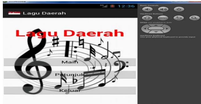
Figure 1. Display the main menu form

The main menu form contains the main display on the Regional Song Game and contains three buttons namely "Play", "Hint", "Exit".