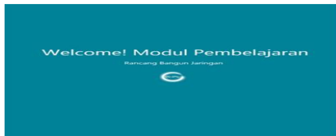
Figure 1. Intro Page Display

The Intro Page is the start page when running the application. The display can be seen in the following image: