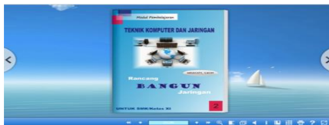
Figure 2. Cover Page Display

The cover page is the front cover of the E-Modul application. The cover display can be seen in the following image: