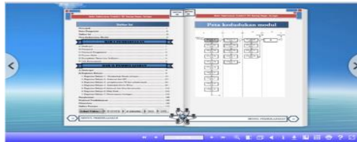
Figure 4. List Of Contents Page Display

The table of contents view displays the discussion chapter page of the module. The table of contents can be seen below: